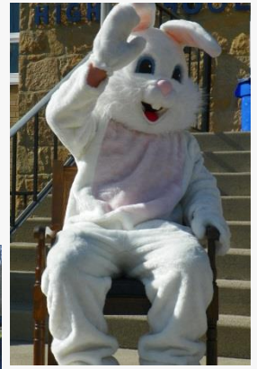
Marian students greet the kids and organize the hunt while the Easter Bunny looks on