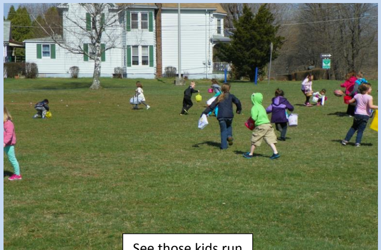
See those kids run

Every year on Holy Saturday, one of the major television networks, I think it's ABC, Runs the movie The Ten Commandments . This may seem really strange to us Christians but our Easter is usually the Jewish feast of Passover. If you have ever watched the movie, you know that the last plaque that God brought upon Egypt for enslavement of the people of Israel was the angel of death coming to kill the first born of the land. But the Jews placed the blood of a lamb on the doorways of their homes and the angel of death "past over" their homes, thus the feast of Passover. We Christians have to remember that we are not alone on this planet that the history of the Jews is also our history since Jesus, our Lord and Savior was a Jew. So in a way, the movie is about the Israelites and their escape from Egypt but also about the history of our own religion. So watch the movie and enjoy. By the way, loved Charlton Heston as Moses, how about you?