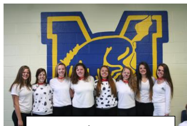
Disney Character Day